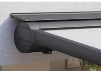
Closed full cassette system