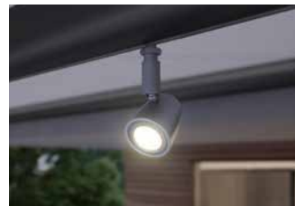
LED Spots attached to the light bar