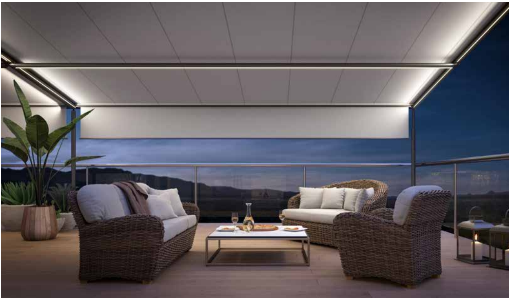
markilux shadeplus and LED lighting

Pergola awning max. 600 × 450 cm max. 500 × 600 cm